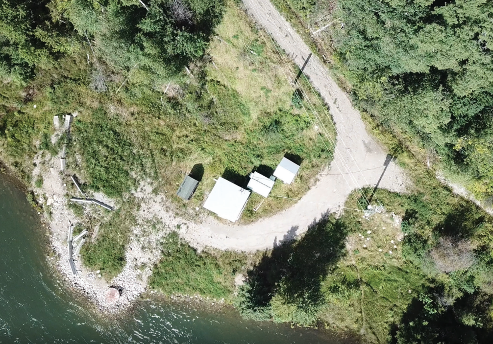
Existing river intake pumphouse buildings.

Industra Construction Corp. (Industra) is helping the community of Hudson's Hope, in northeastern B.C., prepare for the legacy of the Site C Dam.